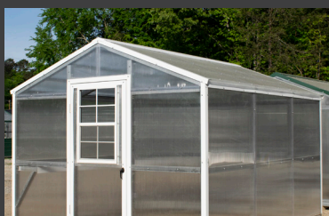
DOUBLE PANEL POLY EXTERIOR