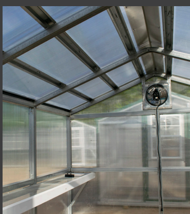
DOUBLE PANEL POLY INTERIOR