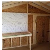
Shown: Interior Options of Workbench w/ Pegboard, Interior Door, & Interior Wall